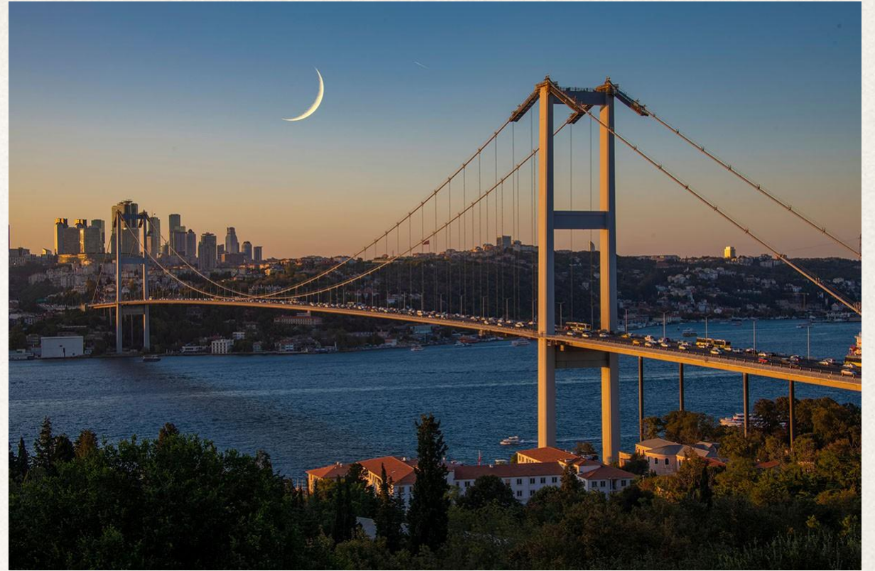
Bosphorus of Istanbul