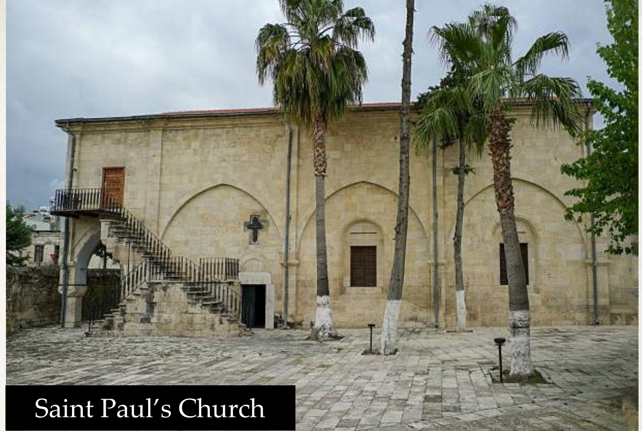
Saint Paul's Church