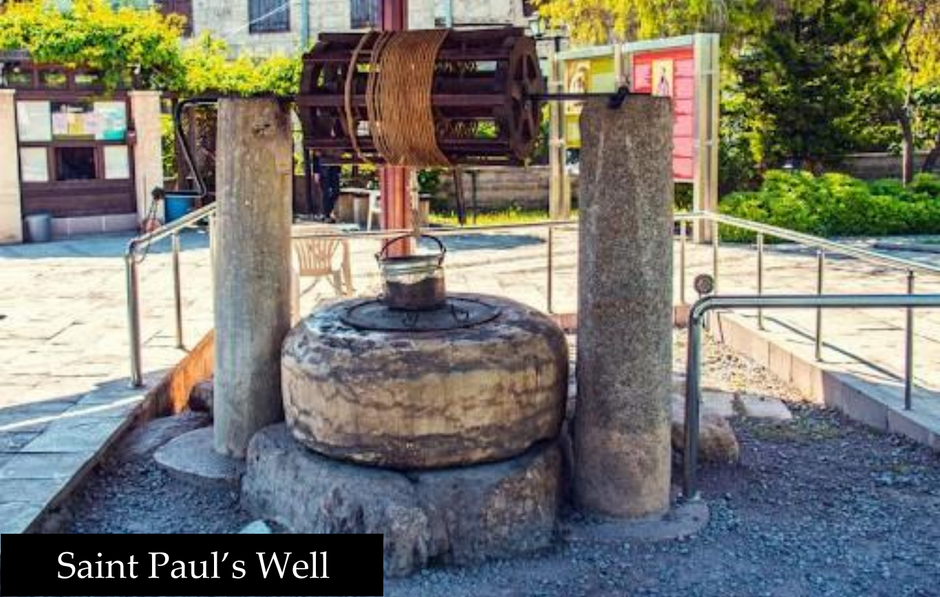
Saint Paul's Well