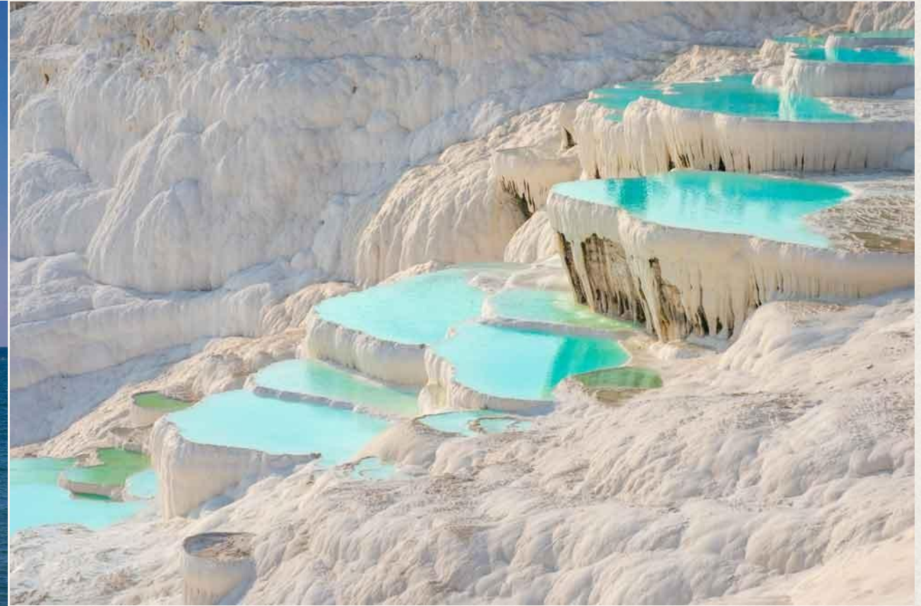
Terraces of Pamukkale