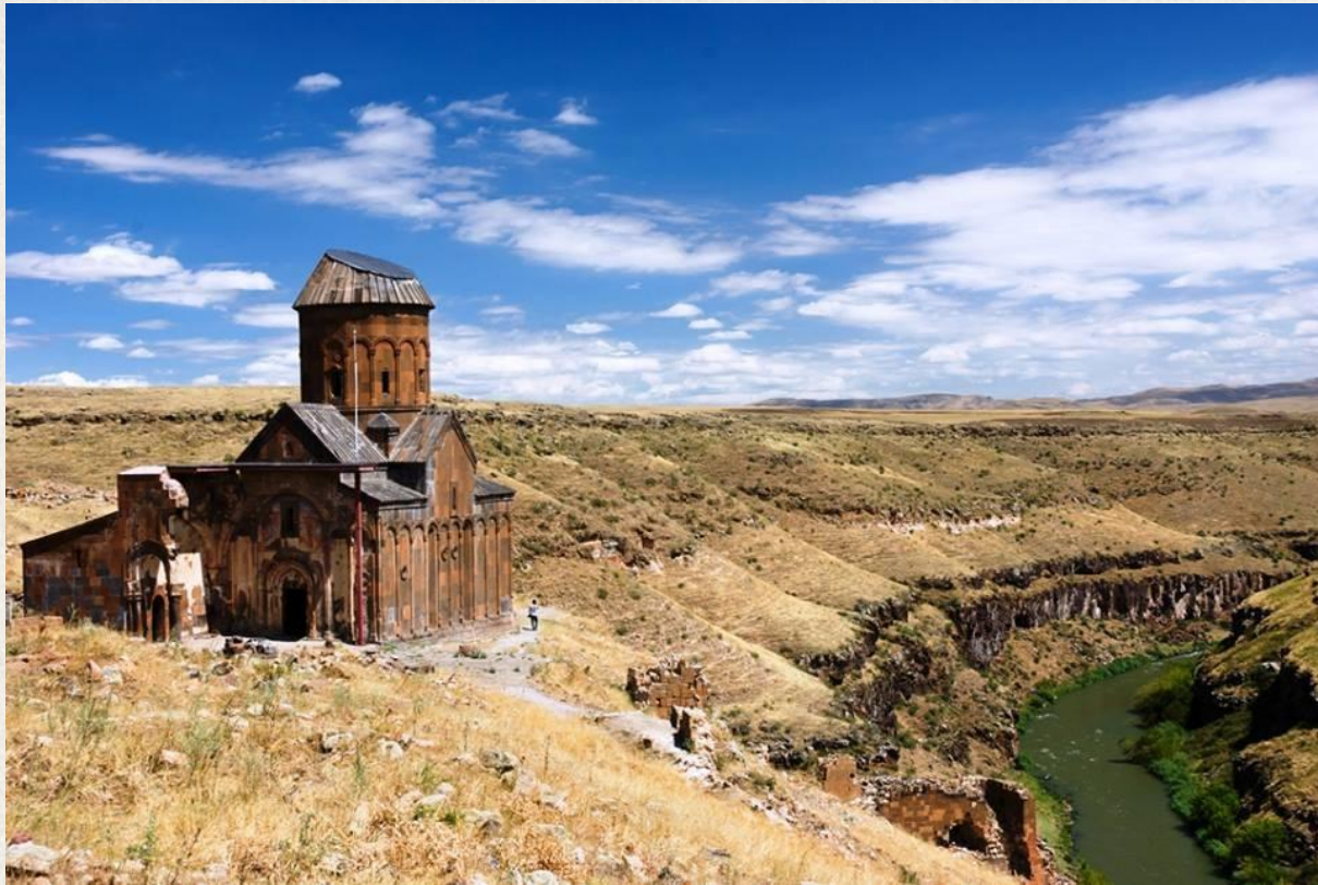
Kars Ani Ancient Ruins