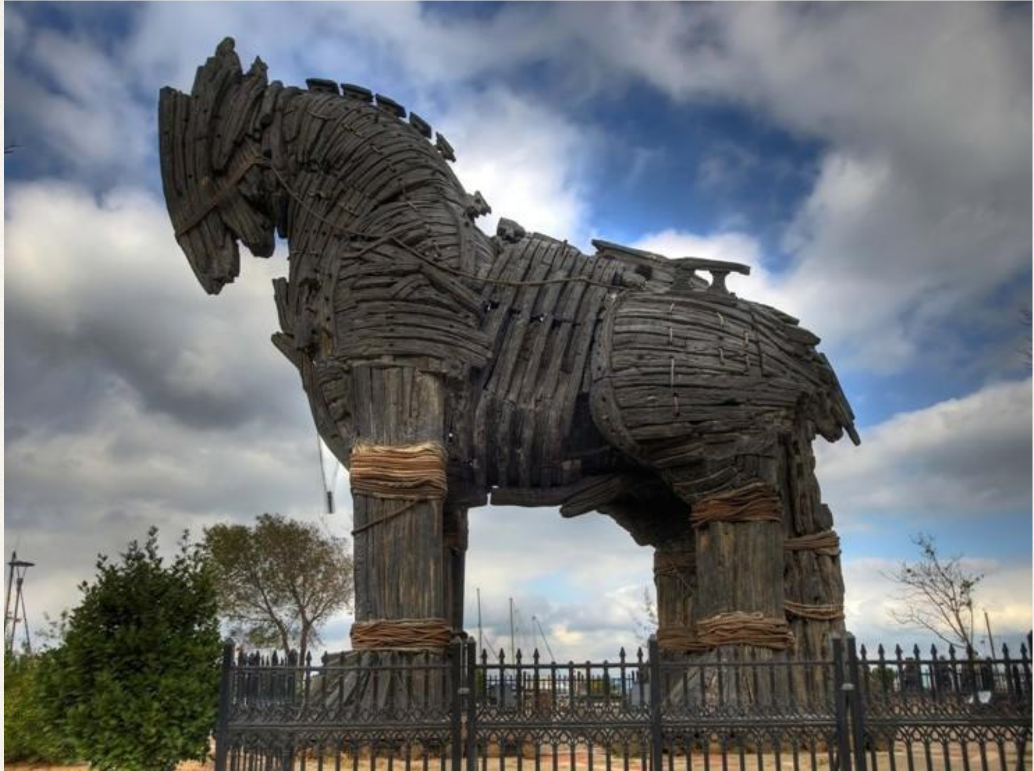
Trojan horse (Çanakkale)