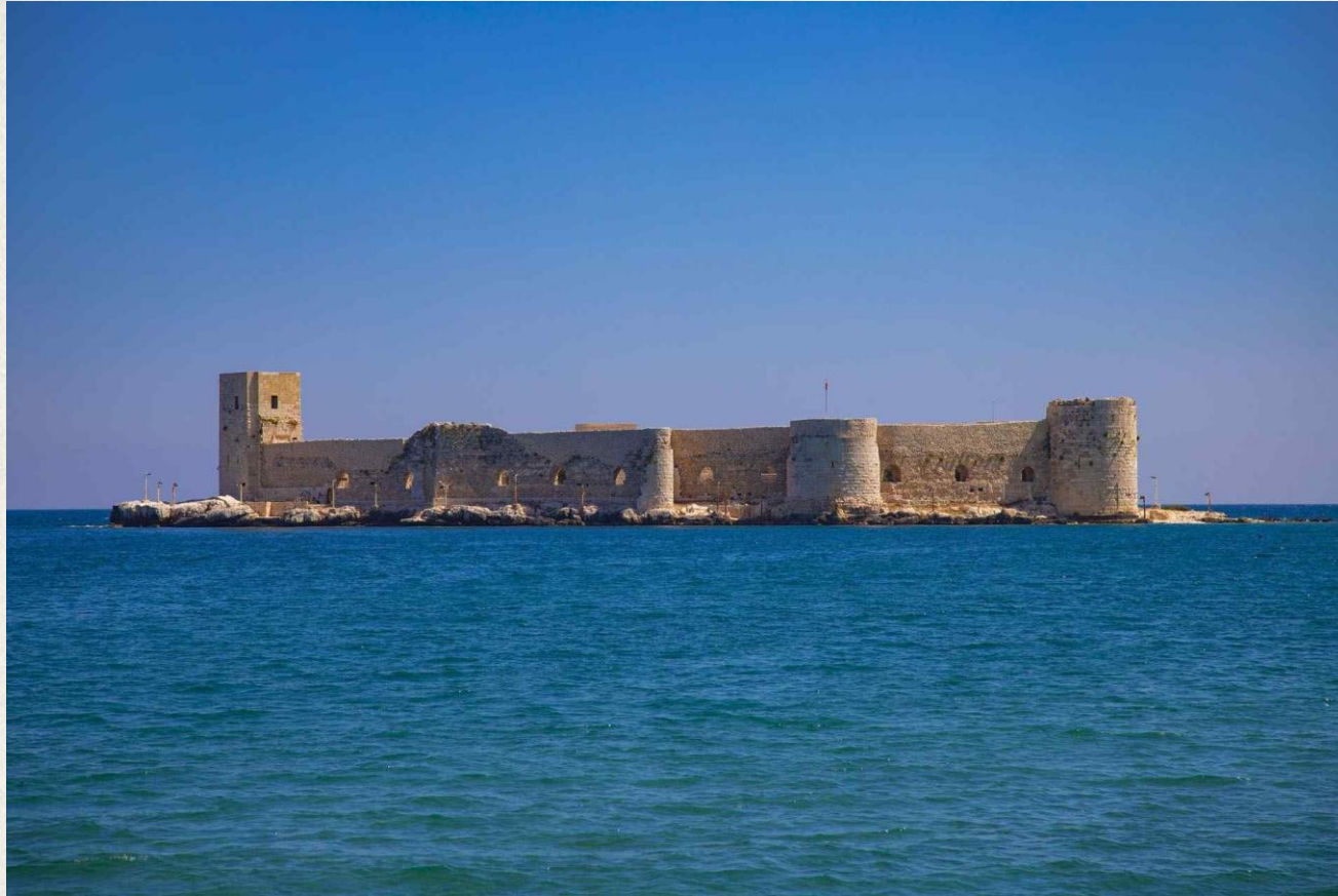
Maidens Castle (Korykos)